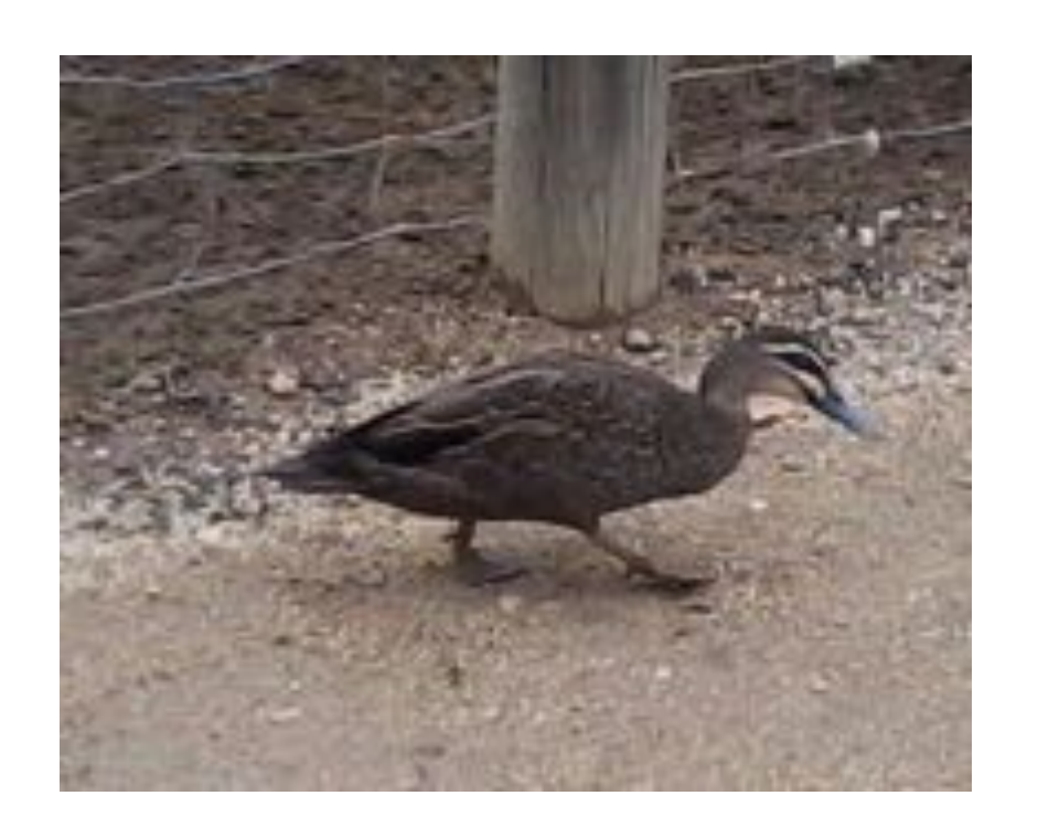
Local Pacific Black Duck as children would see it. Cited Mogo .