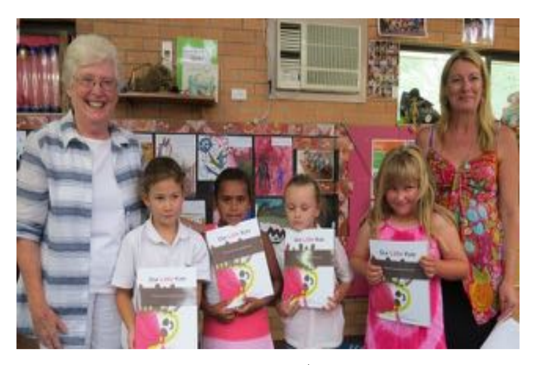
Book Launch at Little Yuin March 3<sup>rd</sup> 2015.