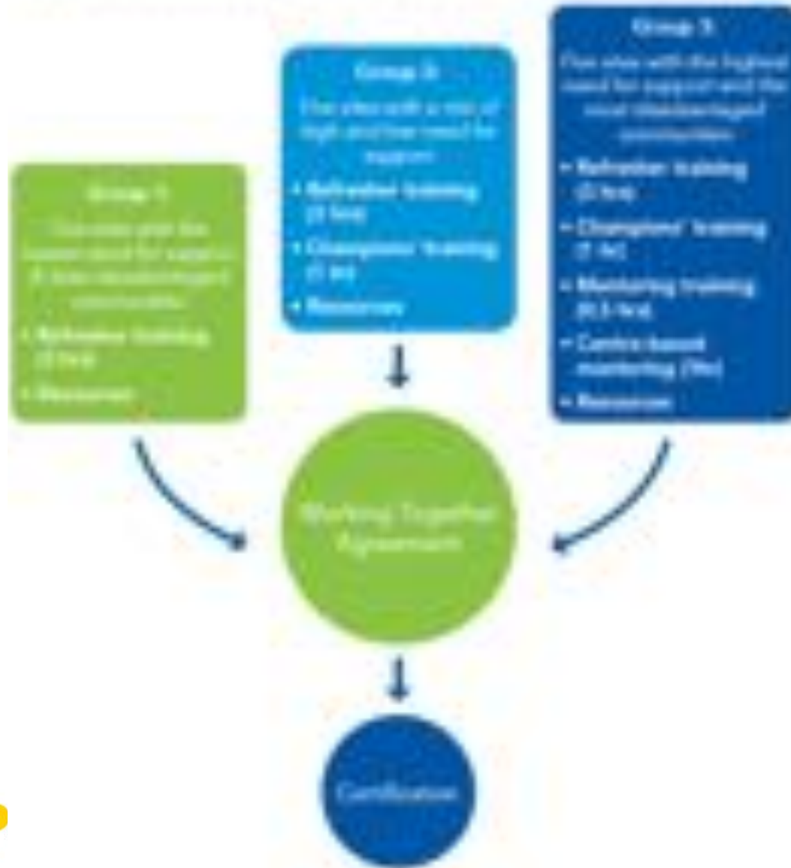
Figure 2: Stratified groups and intervention intensity